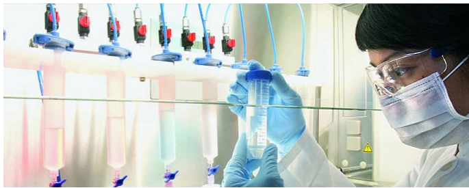
TQ-Systems for Vitamin-D-synthesis

TQ-Systems are used, for example, in photoreactors for basic research in laboratory scale.