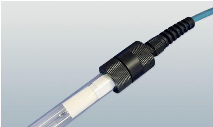
TLSVG 23 with plastic flange

Thanks to the individual production of our TRS / TLS solutions, the systems can be selected to the respective application. There is a suitable immersion system for each of our UV lamps.